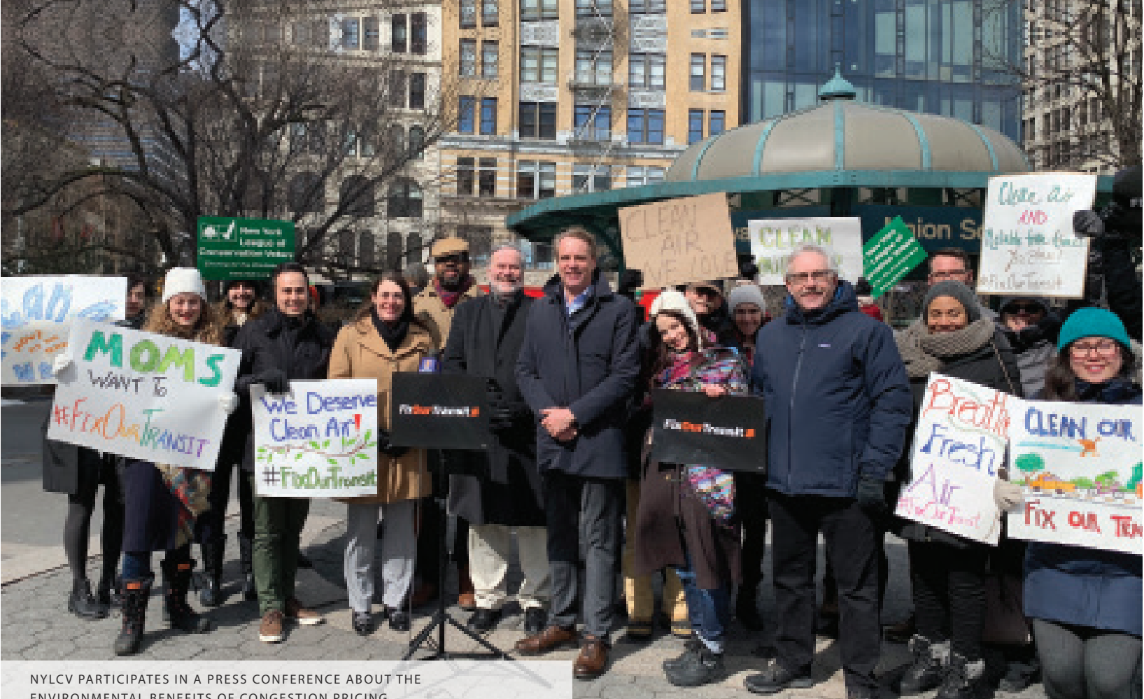
ENVIRONMENTAL BENEFITS OF CONGESTION PRICING

In the past several years, harmful contaminants that are a legacy of New York's industrial past have been found in public water supplies across the state, and there is little doubt that further contamination will be discovered. This legislation will extend the statute of limitations for public water suppliers to sue to recover the large expenses associated with filtering contaminants and protecting public health