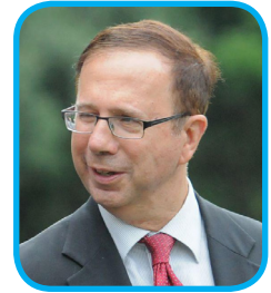
Assemblymember Amy Paulin & Senator Joseph Griffo

Senator Griffo and Assemblymember Paulin were an effective tandem as chairs of the Energy Committee in their respective houses. They were the lead sponsors and champions of bills to increase electric vehicle adoption and promote the development of energy storage, both of which sailed through the legislature.