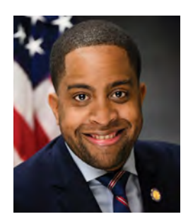
SENATOR Zellnor Myrie