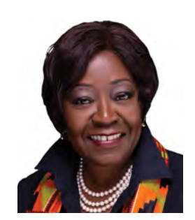
ASSEMBLY MAJORITY CONFERENCE