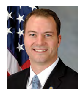
SENATE MINORITY CONFERENCE