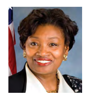
SENATE MAJORITY CONFERENCE 96% Majority Leader