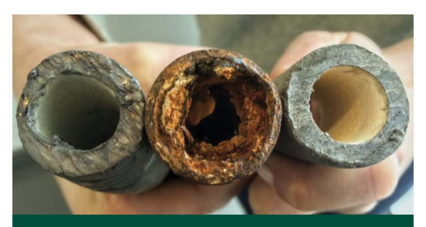
EXAMPLES (FROM LEFT) OF A LEAD PIPE, A CORRODED STEEL PIPE, AND A LEAD PIPE TREATED WITH PROTECTIVE ORTHOPHOSPHATE