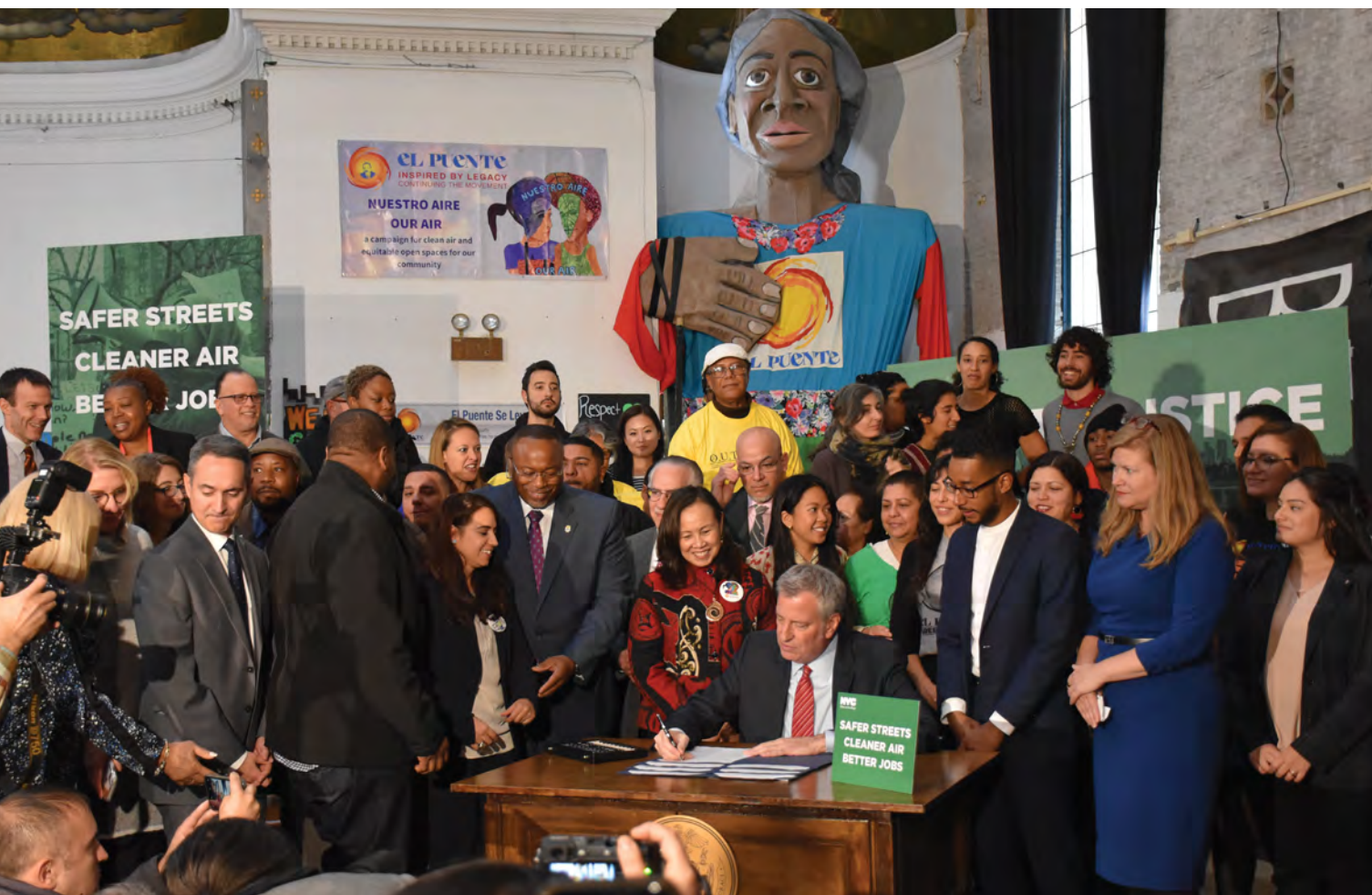
MAYOR BILL de BLASIO SIGNS HISTORIC LEGISLATION ESTABLISHING COMMERCIAL WASTE ZONES IN NOVEMBER 2019

for residents and businesses in bulk, making clean energy more cost-competitive. It is an opt-out program, which means customers who do not wish to participate can withdraw from the program. CCA would aid the transition from an energy system mostly operated by burning fossil fuels to one that utilizes cleaner, renewable energy. If the feasibility study recommends CCA, the Office would develop and make publicly available online a plan for implementation by December 31, 2021. Intro 140-A was introduced on January 31, 2018 and heard by the Committee on Environmental Protection on June 24, 2019. The bill passed on September 25, 2019 by a vote of 45-0.