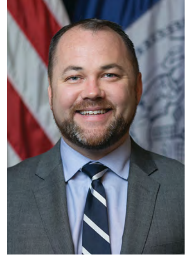
SPEAKER COREY JOHNSON

Finally, the Speaker is able to express environmental priorities via the budget process. New York City's over $92 billion budget must be negotiated with Mayor de Blasio and his administration, but the City Council can lay out their own priorities and fight for their inclusion. Last year Speaker Johnson did just that by championing the Play Fair for Parks Campaign.