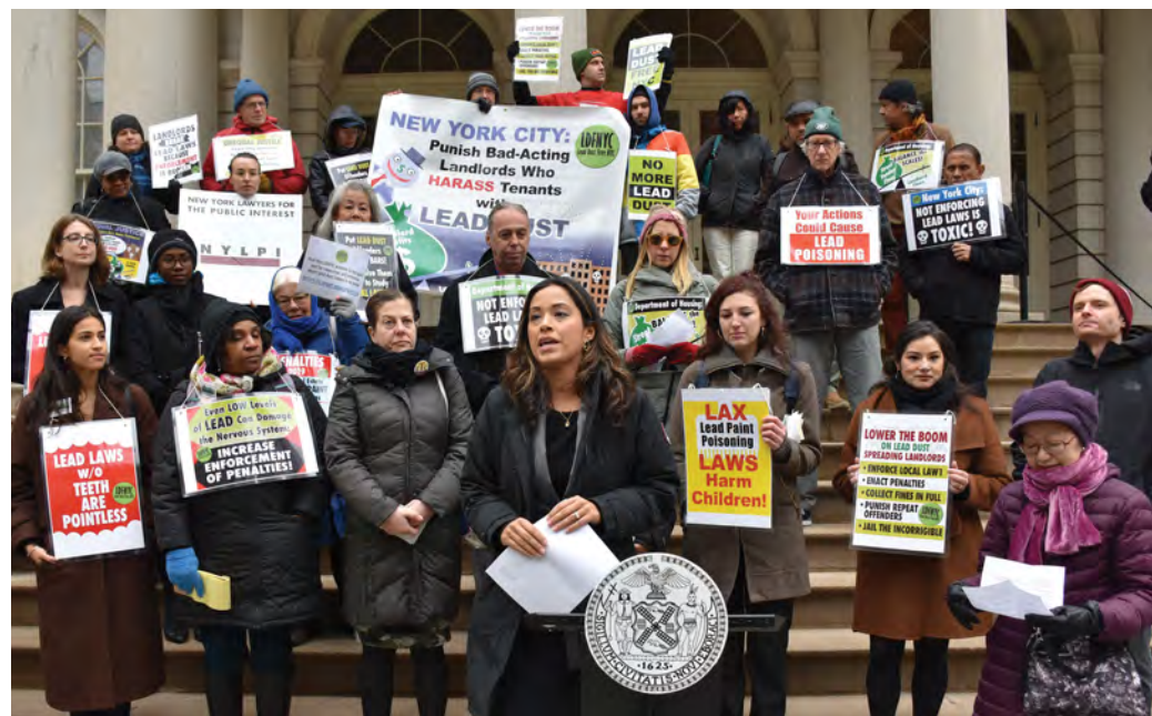
COUNCIL MEMBER CARLINA RIVERA SPEAKS AT A PRESS CONFERENCE ABOUT THE IMPORTANCE OF SAFE WORK PRACTICES IN RESIDENTIAL BUILDINGS TO PREVENT LEAD CONSTRUCTION DUST FROM HARMING NEW YORKERS