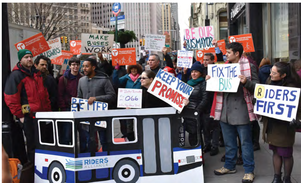
NYLCV JOINS OTHER TRANSIT ADVOCATES IN A CITYWIDE DAY OF ACTION CALLING FOR MORE BUSWAYS

This bill would require all diesel school buses subject to New York City school bus contracts to be retired after they reach 10 years past the manufacturing date and be replaced by either diesel buses that meet the latest EPA standards, Compressed Natural Gas, hybrid, gasoline-powered, or fully electric