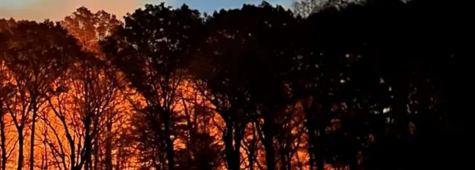
Extreme drought caused wildfires across the region, including in New York City’s Prospect Park (Photo from @FDNY post on “X”).

From advancing transit-oriented development and reforming parking mandates to promoting electric vehicles and composting in city parks, the Council took important steps in the right direction and passed the majority of our Scorecard bills, with a citywide average score increasing to 88%.